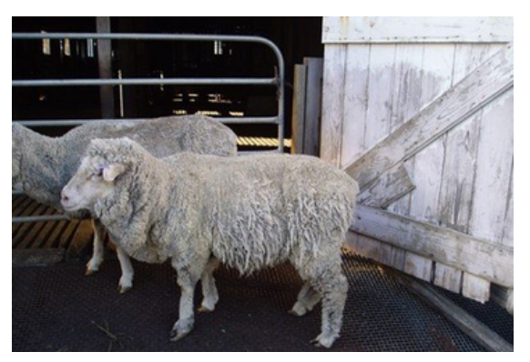
Fig 1: Sheep with fleece derangement, rubbing and pulled wool due to sheep lice

Lice are cunning parasites. They can survive on animals using tactics developed over thousands of years. To outsmart them, we need to understand their biology, their life cycle and also their incredible ability to develop resistance to common chemicals.